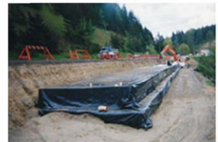
Figure 3 - Installation of GeoSpec Lightweight fill Material